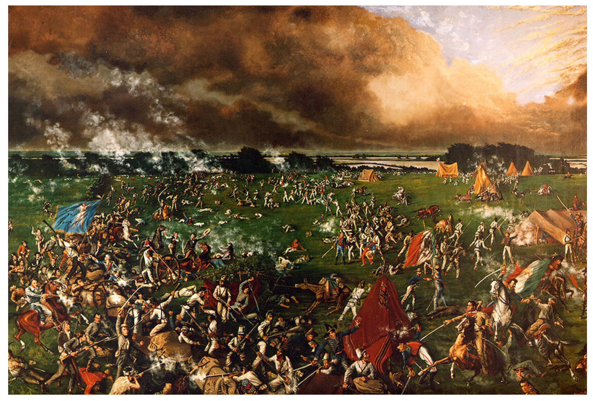
Battle of San Jacinto