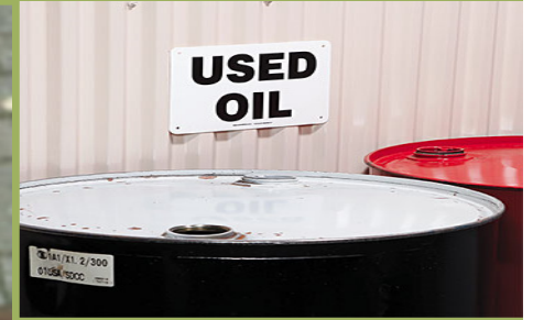
Off-Spec Used Oil