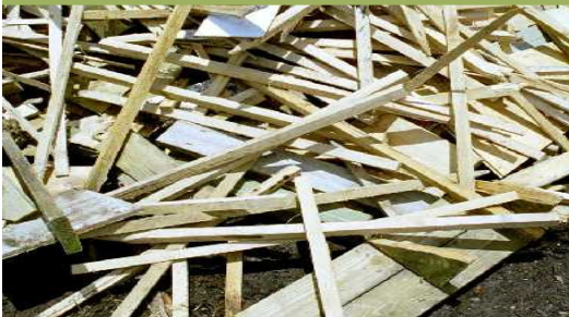
C & D Wood